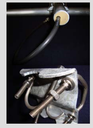
Natural rubber plugs & Heavy-duty galvanized clamp w/S.S. hardware

*Site-specific mounting masts and clamps are recommended for Delta0 Series antennas. Please consult JAG to determine suitable accessories for your application